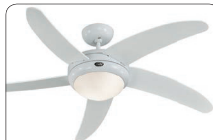
ELICA WE-WE #9513279 housing white coated, sickle-shaped blades, white glossy finish