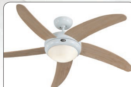
ELICA WE-AH #9513296 housing white coated, with sickle-shaped blades maple

For further combinations please see price list!