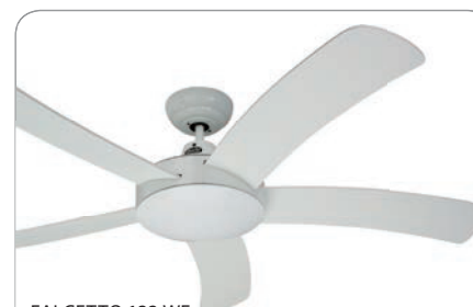
FALCETTO 132 WE #9513272 die cast aluminium housing, white, sickle-shaped blades white