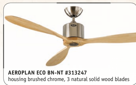
AEROPLAN ECO BN-NT #313247 housing brushed chrome, 3 natural solid wood blades