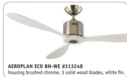
AEROPLAN ECO BN-WE #313248 housing brushed chrome, 3 solid wood blades, white fin.