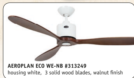
AEROPLAN ECO WE-NB #313249 housing white, 3 solid wood blades, walnut finish