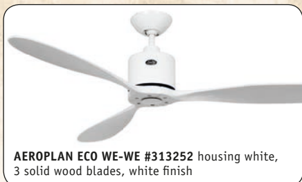
AEROPLAN ECO WE-WE #313252 housing white, 3 solid wood blades, white finish