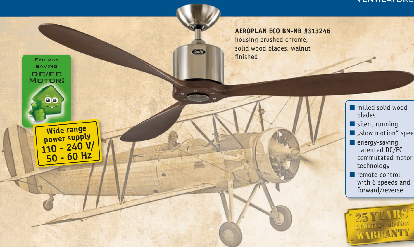
AEROPLAN ECO BN-NB #313246 housing brushed chrome, solid wood blades, walnut finished