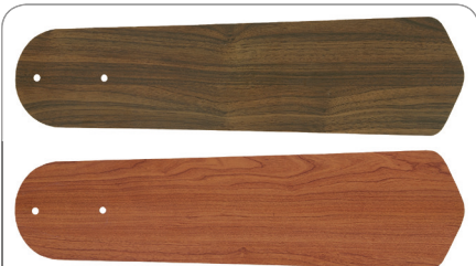
Reversible wooden blades , one sided walnut, one sided American cherry finish