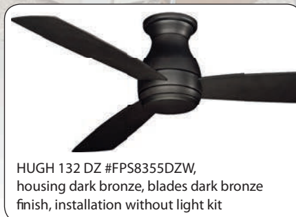
HUGH 132 DZ #FPS8355DZW, housing dark bronze, blades dark bronze finish, installation without light kit