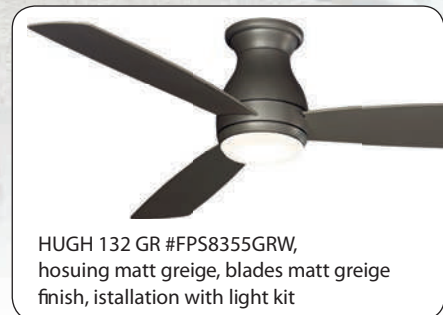
HUGH 132 GR #FPS8355GRW, housing matt greige, blades matt greige finish, installation with light kit