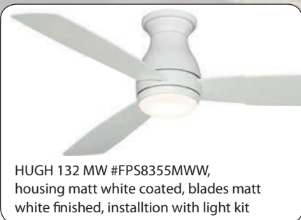
HUGH 132 MW #FPS8355MWW, housing matt white coated, blades matt white finished, installation with light kit