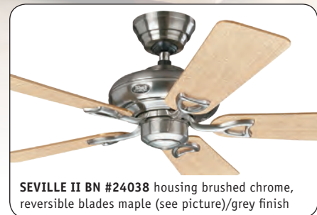
SEVILLE II BN #24038 housing brushed chrome, reversible blades maple (see picture)/grey finish