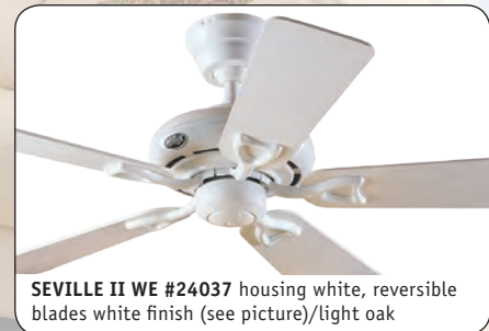
SEVILLE II WE #24037 housing white, reversible blades white finish (see picture)/light oak

SEVILLE II NB #24039 housing new bronze, reversible blades dark cherry (see picture)/medium oak